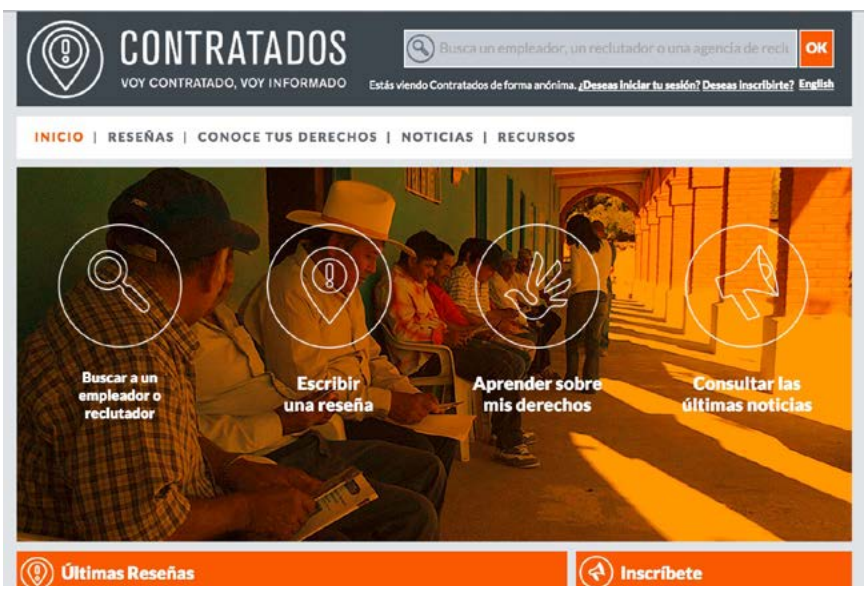
↑ Contratados Homepage

develop and to get on the same page, even as pressure mounted to get the project to launch. As usually happens, there were also many moments where the project priorities shifted midstream. We also ran into various hurdles with a lack of interoperability between different tools we were trying to integrate on the backend of contratados.org. Ultimately, though, everyone was happy with the project outcomes!