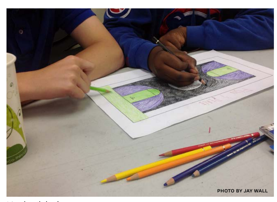
↑ Local youth drawing

their challenges. It would identify the sports court as an inclusive community space to be enjoyed by all. As we neared a final design, I supported ERA Architects in translating the concept into final graphics and selecting materials for construction.