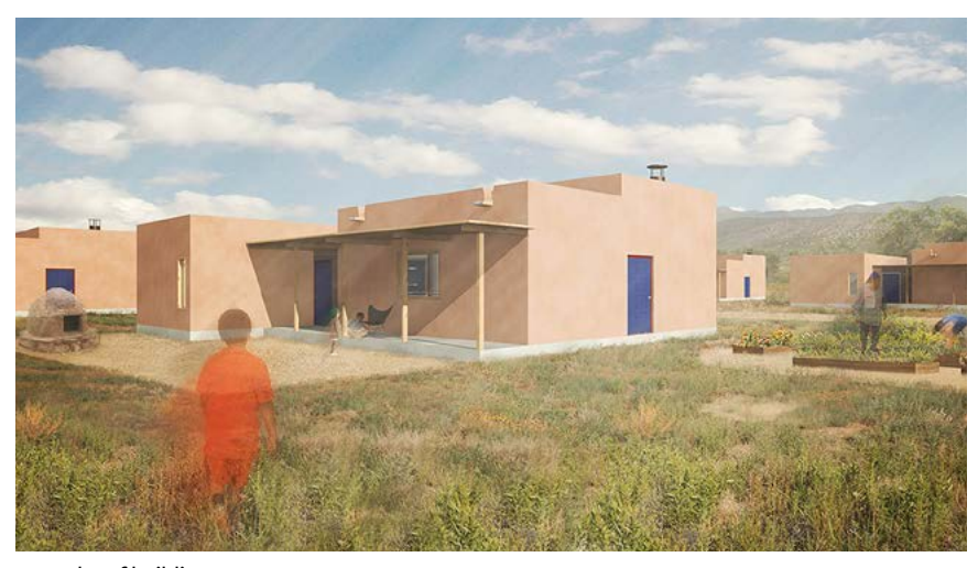
\uparrow Render of building

design with residents of every socioeconomic level, because a building is an opportunity to improve a family's dignity, health, and wellbeing.