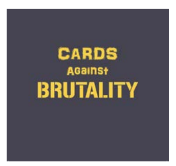
↑ Cards Against Brutality Cover