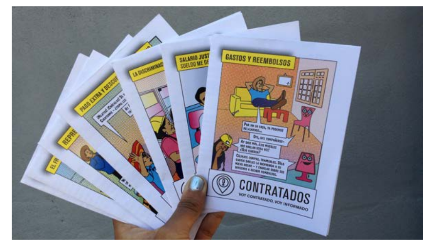
↑ Contratados comix

CDM owns the project, and currently has a dedicated staff member who is developing a plan for the future sustainability of the project.