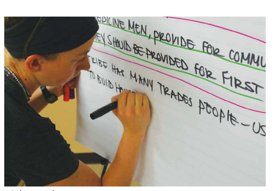
↑ Brainstorm session

families and the whole community. Many topics relating to housing and the peripheral benefits of a new model for design and development were brought to the team. Along with gathering this information, the team had the meeting participants sketch ideas which will contribute to the Schematic Design Phase. Some key points from the meeting: