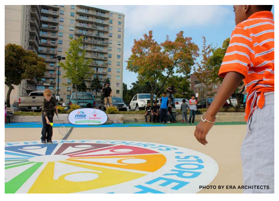
↑ Sportscourt in use

East Scarborough Storefront which is widely celebrated as a model for positive city-building in Toronto's inner suburbs that engages several dimensions of economic development, youth capacity-building, place-based poverty reduction.