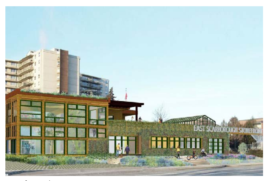
↑ Storefront render

provides kids a much-needed safe space to play. The Kingston-Galloway-Orton Park community is very proud of the sports court and it is enjoying lots of use by local residents and community sport programs mostly for basketball, occasionally soccer, and also just as a safe place to hang out. The process itself provided mentorship and capacity building to local youth who learned about design, construction, and project management. It also led to the creation of spaces that local residents are proud to call their own. It's important to note that the sports court is just one part of the Community Design Initiative at the