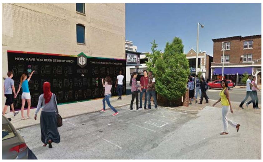
↑ Vibe switch wall render

Creative Reaction Lab produced five projects across the various design teams during the 24 hour event. Of those projects, four had successfully made it into the implementation phase. Four out of the five projects