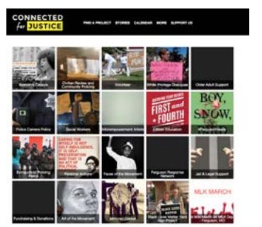
↑ Connected in Justice webpage